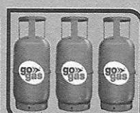
Packed Cylinder Marketing